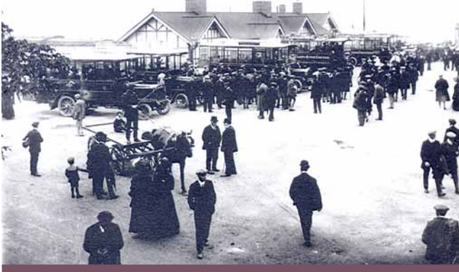
Pen Cob, Pwllheli in the train and bus era

Travelling over land was very difficult before the turnpike roads were built, from Porthdinllaen to Boduan and the branch towards Pwllheli and Porthmadog, in the early C19th. The turnpike road from Llanbedrog to Pwllheli was built in 1824.