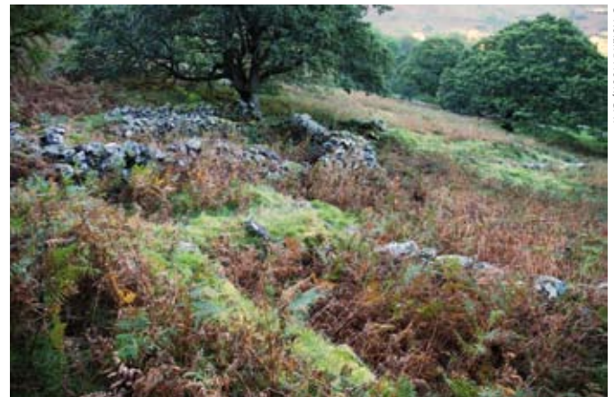
Two of the buildings in this long hut cluster (Stop 3) have been dated to the thirteenth century