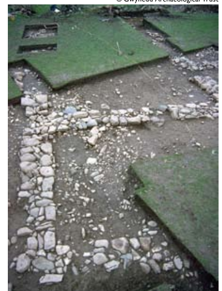
The foundations of the hall revealed during the 1993 excavations