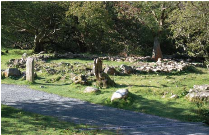
The Iron Age roundhouse that became the site of a grain-drying kiln in the Middle Ages (Stop 4)