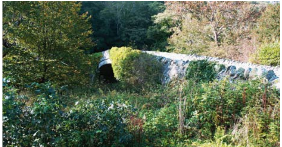
Bont Newydd (Stop 2)

An Iron Age hillfort, Maes y Gaer, is perched above you to the north and an ancient route from the Conwy Valley over the mountains came down to Bont Newydd, and continued across the tidal sands and the Menai Strait to Llanfaes in Anglesey. This crossing was busy until the building of Telford's Menai Bridge in the early nineteenth century. The positions of the hillfort, motte and llys might all be partly explained by Aber's strategic position.