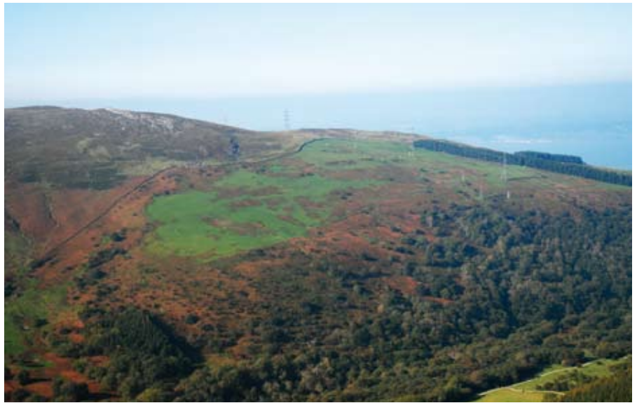
The landscape of Cae'r Mynydd (Stop 5) — Mountain Field — preserves traces of Iron Age fields and settlements as well as medieval ploughing and long huts

The kiln, which may be contemporary with the medieval long huts, provides further evidence for arable farming in the vicinity. The archaeologists discovered that wheat, barley and especially oats were dried in the kiln. Oats and barley were staple cereals in the medieval diet, but were also widely used as fodder crops for cattle. Here at Aber, as elsewhere in Gwynedd, cattle rearing was of central importance to the economy of the princes' upland estates in the thirteenth century. It is likely that much of the oats and barley grown here and dried in the kiln was destined to feed cattle rather than people.