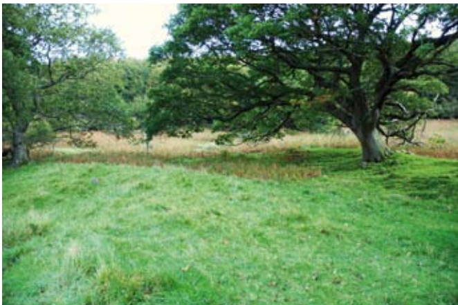
The banks in this photograph are lynchets (Stop 3) formed by sustained ploughing

This group was excavated in 1961. Most of the structures date from the eighteenth to early nineteenth century and probably represent a dairy. However, the top pair (a dwelling and a barn) are older, cut into and perpendicular to the slope of the hill and now partly overlain by the sheepfold. Pottery dated them to the thirteenth century.