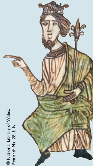
© National Library of Wales, Peniarth Ms. 28, f. 1v

A Welsh prince in an illustration from a mid-thirteenth-century copy of the law book of Hywel Dda