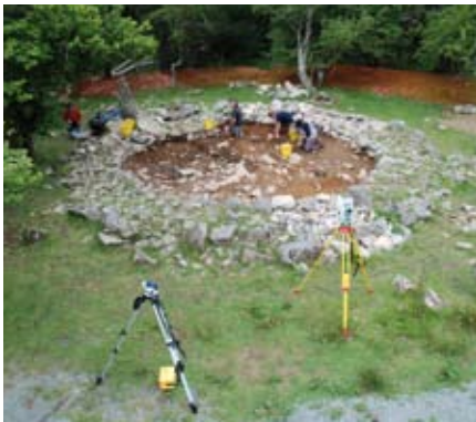
The roundhouse site during excavation

The royal ffriddoedd were, however, farmed more intensively and may have been occupied and grazed year round to maximize the prince's income from cattle rearing. The ffriddoedd were in valleys or on sheltered hillsides and would have been farmed by the taeogion . The long huts at Cae'r Mynydd, clustered between ffriddoedd and open mountain, may be the dwellings of people who integrated the more intensive